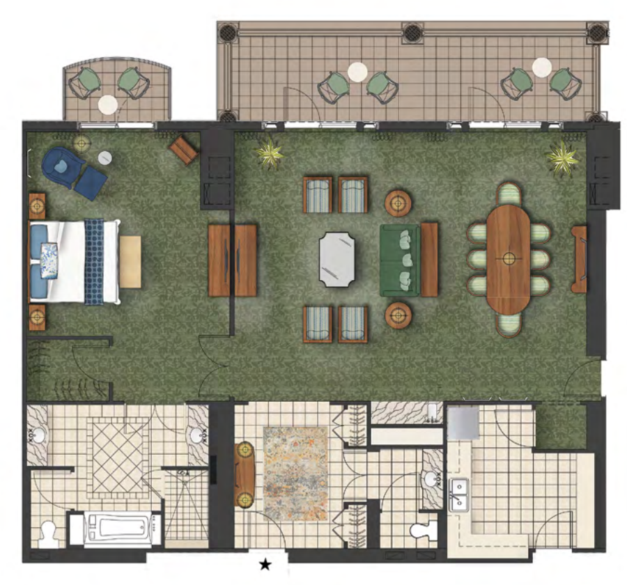
1,538 SQUARE FEET

Flooded with natural light, the Governor's Suite showcases coffered ceilings and walls hung with original artwork, harboring welcoming areas for sharing meals and conversation. An en suite butler's pantry bestows the possibility of discreetly served, private dining for up to eight guests. The regal King bedroom leads into a dressing room with two walk-in closets and a bath with a walk-in rainshower and large jetted tub, providing the ultimate personal relaxation. This suite can adjoin with a Double Queen guestroom.