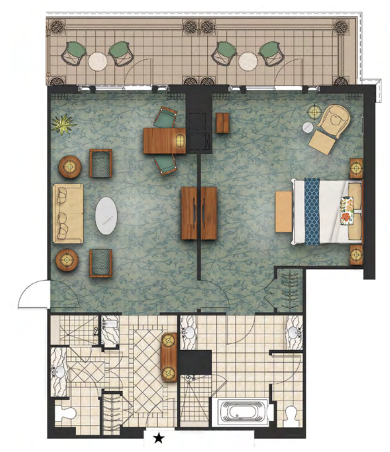
1,130 SQUARE FEET

The Ocean View Suite is complemented by picturesque Grand Lawn and Atlantic Ocean vistas from your private balcony. Settle into graciously refined accommodations complete with a King bed in the bedroom and a pullout sofa bed in the living area, plus two full baths. The Ocean View Suite can adjoin with a Double Queen guestroom.