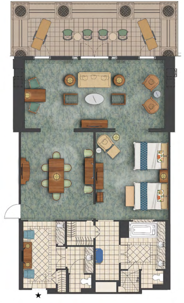
1,515 SQUARE FEET