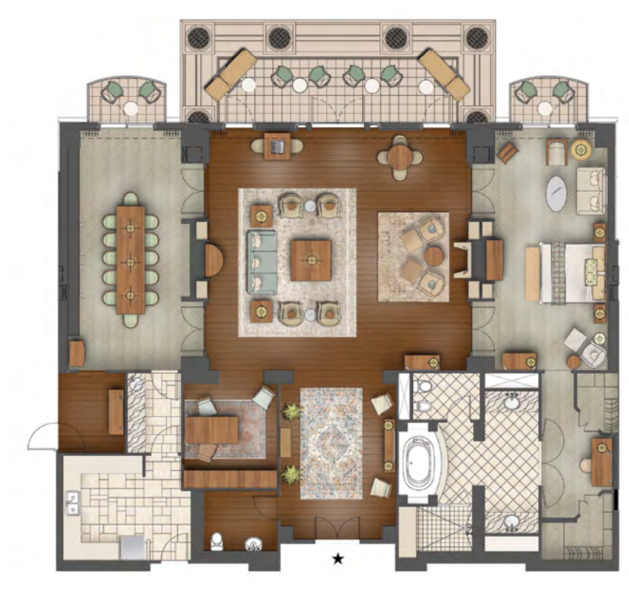
3,000 SQUARE FEET

The pinnacle of luxurious accommodations, showcasing the Atlantic Ocean and Grand Lawn from a private outdoor balcony retreat. The living room entices with original artwork, an inviting fireplace and custom furnishings. Antique leather-bound books and a cherrywood desk line the library walls. The dining room seats twelve guests around a mahogany table, and a butler's pantry affords chef-catered dining. King-sized quarters boast a four-poster bed, seating area and private dressing room, as well as a spa-inspired master bath featuring marble vanities, a jetted garden tub and a walk-in shower. This suite can adjoin a Double Queen guestroom.