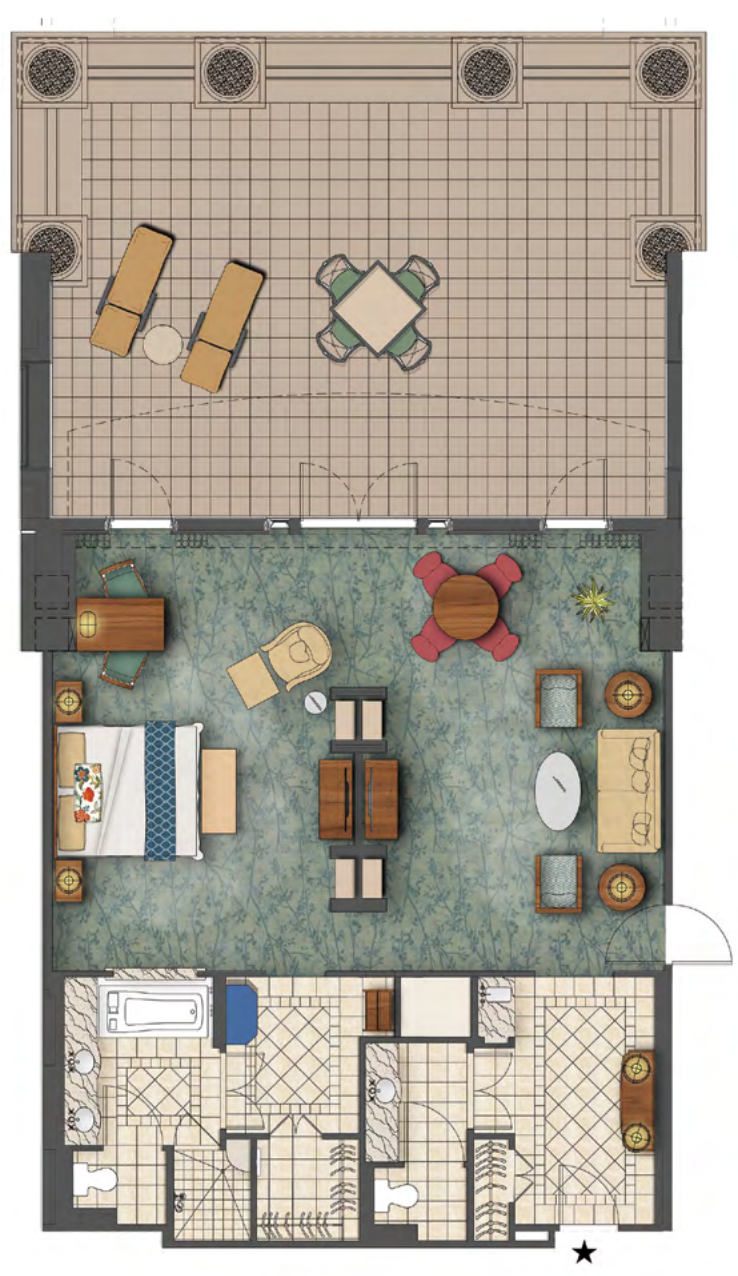
1,130 SQUARE FEET

The Garden View Suite opens onto a peaceful balcony, granting a closer glimpse of the majestic oaks and lush maritime forest outside. Delight in the marble foyer featuring a powder room and wet bar, the living room with an elegant seating area with a sleeper sofa, and the dining area that comfortably seats four. Your sleeping area comprises a King bed with fine, custom linens and a bath with rainshower and garden tub, radiant with natural light. The suite can adjoin a Double Queen guestroom.