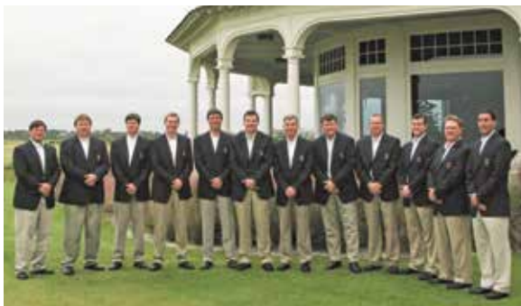
Kiawah's dedicated staff of PGA golf professionals and GCSAA superintendents.